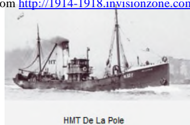
HMT De La Pole