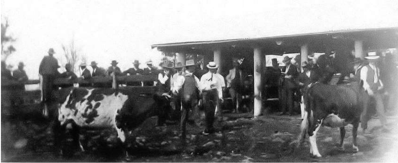
The last cattle sale at Kyla Park 1908

With transcripts from the Moruya Examiner by Helen Townend