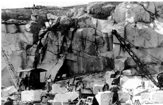
Above: Work at the Quarry Face

November 14, 1931 The attendance at Granite Town Public School shrunk this term from 49 to 5, and was closed on Friday 13 th inst.