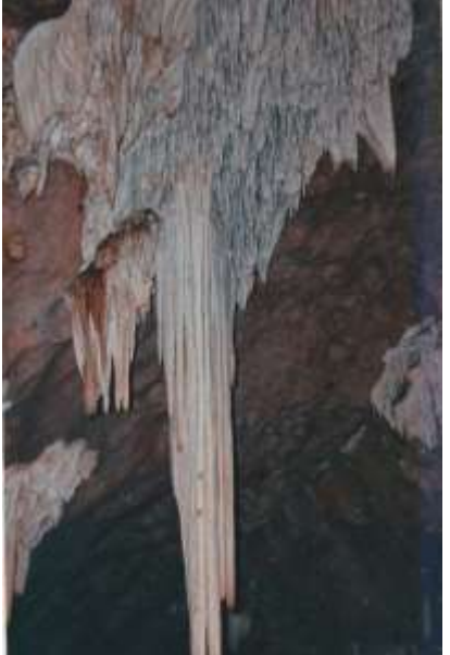
Caves photos from the Reid Family collection